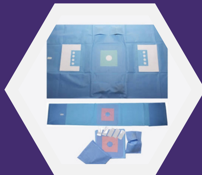
KNEE O DRAPE